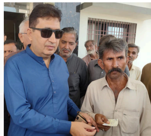
Financial Assistance Program