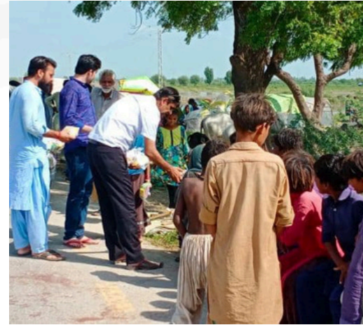
Flood Relief Drive