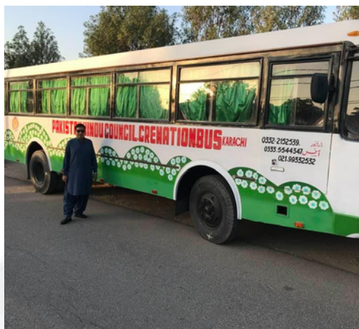
Coffin Carrier Bus Services